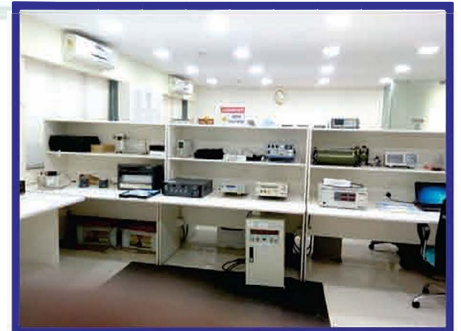
Safety & Climatic Labs