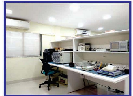
EMC & Safety Labs